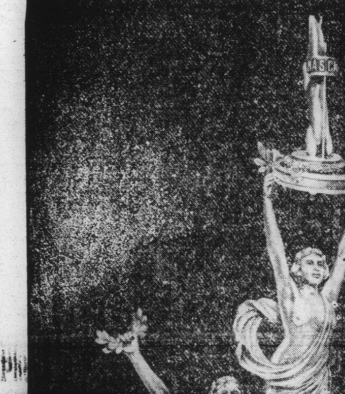
The PURE Oil Trophy for best all round performance was won by Ford in 1956 and Chevrolet in 1957, using PURE gasoline.

There are two kinds of polite—I am; the other, "I would make a mess; one says, "See how polite you happy." —Tomlinson