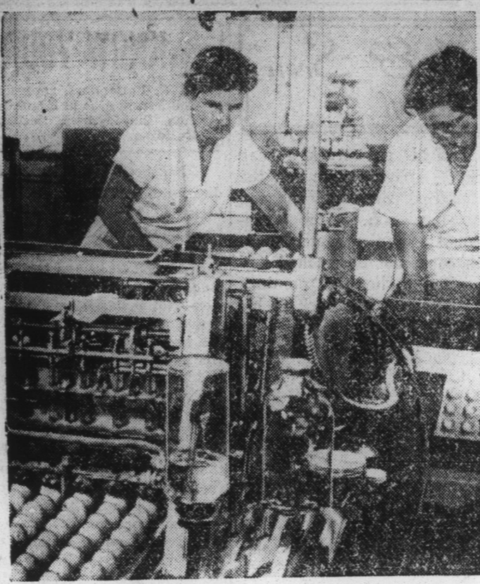
ARSENAL FOR FLU WAR—Workers at a pharmaceutical laboratory in Indianapolis, Ind., process eggs in which the Asiatic flu virus is cultured as a major step in making an influenza vaccine. Several American laboratories are preparing massive quantities of the vaccine should the disease become epidemic with the coming of cold weather. The Asiatic flu, a relatively mild strain heretofore unknown in the United States, has swept through much of Asia and parts of Europe.

There are two kinds of polite—I am; the other, "I would make a mess; one says, "See how polite you happy." —Tomlinson