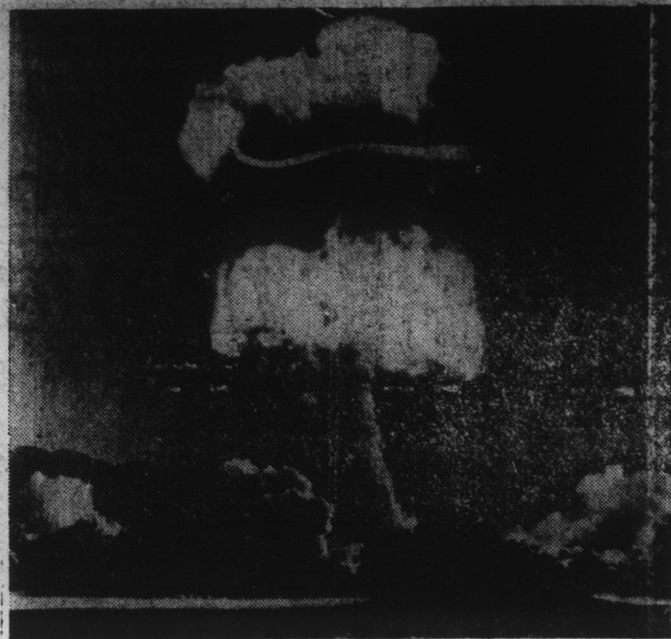
ATOMIC BLAST churns the Nevada desert and rises skyward as "Priscilla" shot of Operation Plumbbob, the current series of atomic tests, hurls tremendous force against a new "ghost form" of shelter structures built as possible prototype for future blast resistant buildings and shelters in the more vital target areas.