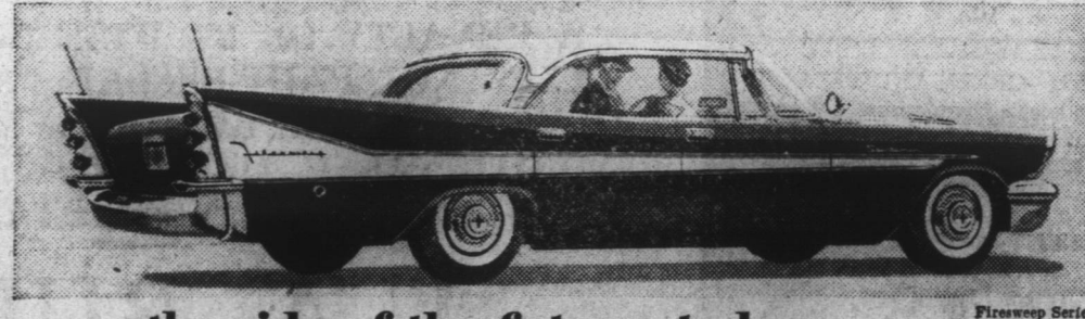
the ride of the future...today

CHOWAN MOTOR COMPANY, INC. West Water Street Dealer's Franchise No. 829 Edenton, N. C. PRICES START JUST ABOVE THE LOWEST... FIRESWEEP · FIRESTONE · FIREFLITE