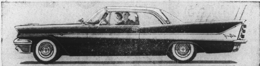
the look of the future...today

...the exciting look and feel of the future!