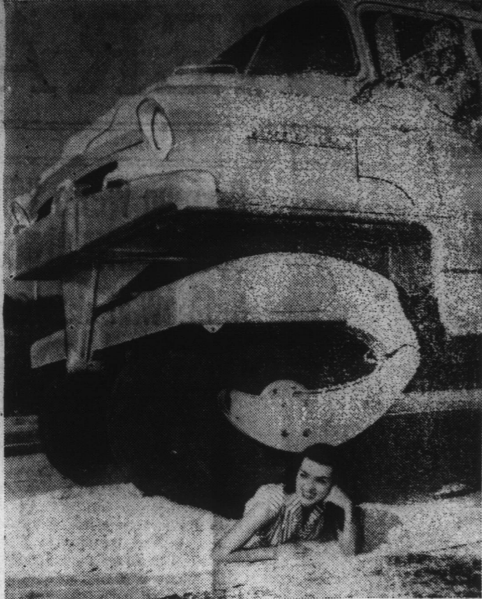
FEELING NO PAIN — Smiling Cindy O'Hara, 18, "Miss International Auto Show," bears up very well under the strain as seven tons of truck rolls over her in San Francisco. The unusual vehicle, which moves on huge, sausage-shaped pneumatic pillows instead of conventional wheels and tires, is called the Rolligon. On display at the 32nd annual San Francisco International Auto Show, the truck is able to "float around them." It is able to carry heavy loads over very rough ground.

If men be good, government cannot be bad. —Wm. Penn.