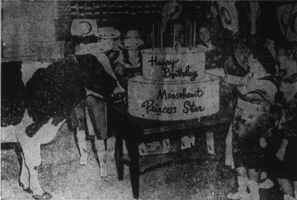
PRIDE OF MOOSEHEART —Casting a bovine glance at her birthday cake is Mooseheart (JL) Princess Star (cow at left), holder of a world's record for milk production. She is presented with the cake by members of the Moose Child City Girls Drum and Bugle Corps on her 10th birthday. Princess Star has produced more than 145,000 pounds of milk and 6,700 pounds of butterfat during her career. She's the matron of the purebred dairy herd of Mooseheart, which produces at least a quart of milk each day for the nearly 300 children in the town.