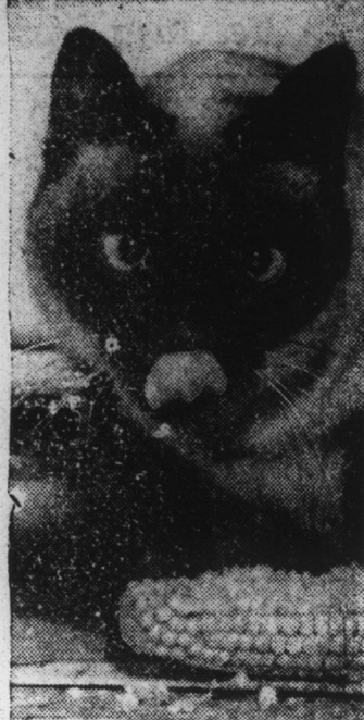
HER FAVORITE—Licking her chops, Suzy, a 4-year-old Siamese cat, comes up for air while putting away her favorite food—corn on the cob. The St. Joseph, Mo., feline is a real sour-puss when milk is put in front of her but the corn is just purr-fect.