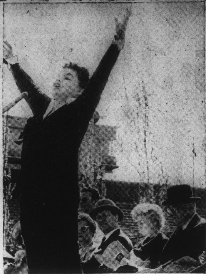
SHE SINGS; HE WRITES —Veteran trouper Judy Garland gives it her all as she winds up a song in Minneapolis during Statehood Day ceremonies at the University of Minnesota. Secretary of State John Foster Dulles, far right, appears to be missing Judy's song as he concentrates on notes for his speech.