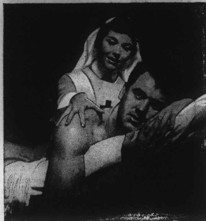
Rock Hudson and Jennifer Jones are seen in a key scene from the David O. Selznick production of Ernest Hemingway's great "A Farewell to Arms," a Twentieth Century-Fox release which also stars Vittoria De Sica. The film is at the Taylor Theatre, beginning May 25th.