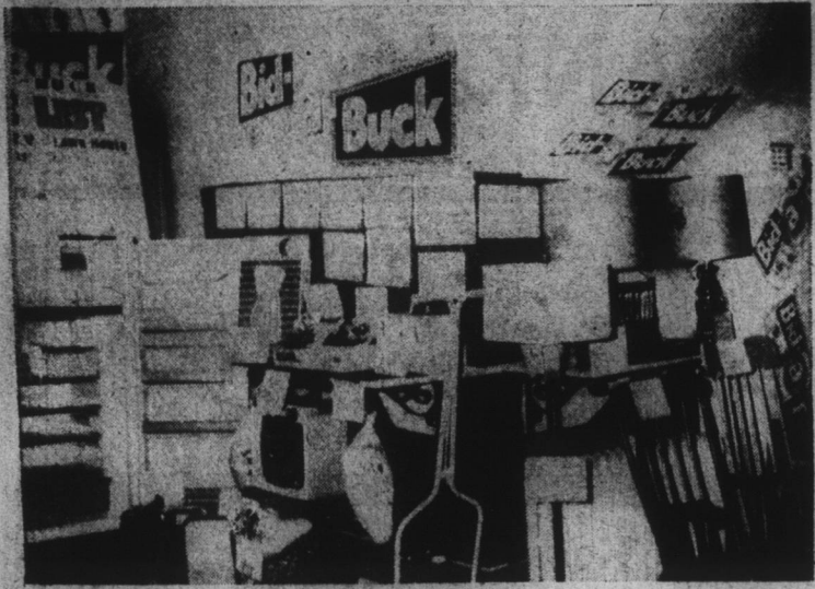
Edenton's Bid-A-Buck sales promotion event will come to a close Saturday, November 29, when an auction will be held on the Court House Green. Prizes worth over $1,600 will be auctioned off at that time with the Bid-A-Bucks to be used as money. In above picture are some of the items which will be sold and are now on display in the lobby of the Peoples Bank & Trust Company.