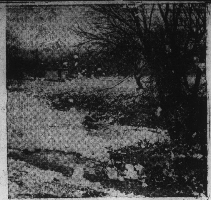
SUDS WINTRY WEATHER-Soaps and detergents from thousands of suburben sinks paint this wintry picture on the outskirts of Chicago, Ill. Such feaming is a familiar sight to