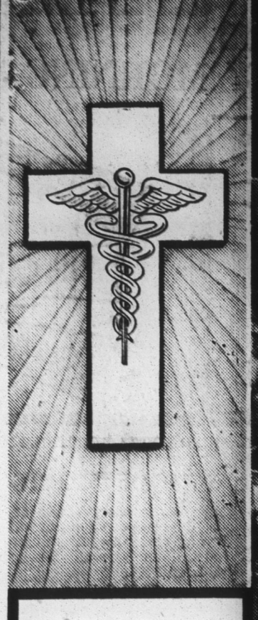
THE CHURCH FOR ALL : . . ALL FOR THE CHURCH

The Church is the greatest factor on earth for the building of character and good citizenship. It is a storehouse of spiritual values. Without a strong Church, neither democracy nor divilization a survive. There are four sound reasons why every person should attend services regularly and support the Church. They are: (1) For his own sake, (2) For his children's sake. (3) For the sake of his mmunity and nation. (4) For the sake of the Church itself, which needs his moral and material support. Plan to go to church regularly and read your Bible