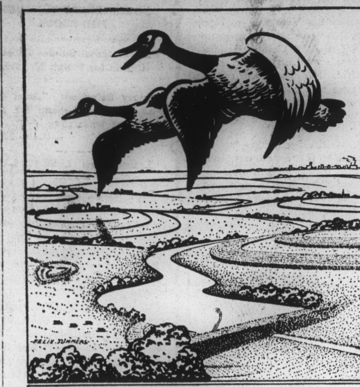
"FARMERS WHO FOLLOW SOIL CONSERVATION PRACTICES ARE 'ON THE BEAM!'"

I think the most feared thing in the world is loneliness. When we stand before God's Throne we will not have the world to lean on and blame our shortcomings