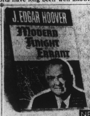
neglected a program to prevent future crime by emphasizing proper upbringing of the nation's youth. Advocating healthy family life, he says: "Youngsters who have love, understanding, and adequate discipline in a poverty-ridden home are far less 'underprivileged' than those who may be surrounded by material wealth but who lack affection, understanding and discipline."