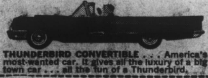
THUNDERBIRD CONVERTIBLE... America's most-wanted car. It gives all the luxury of a big town car... all the fun of a Thunderbird.