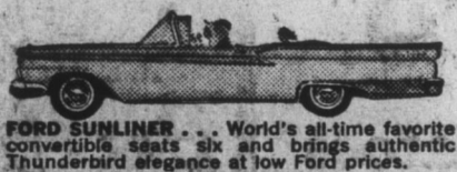
FORD SUNLINER... World's all-time favorite convertible seats six and brings authentic Thunderbird elegance at low Ford prices.