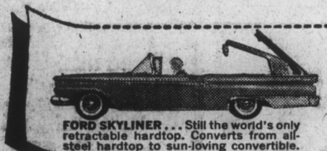
FORD SKYLINER... Still the world's only retractable hardtop. Converts from all-steel hardtop to sun-loving convertible.

Only America's STATION WAGON and CONVERTIBLE SPECIALISTS offer so many for so little!