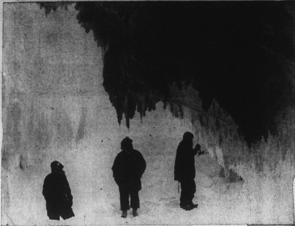
COLD COMFORT FOR SUFFERERS from the current heat wave is this under-zero, underground view of an ice cavern in Antarctica. Explorers are Navy weather personnel.