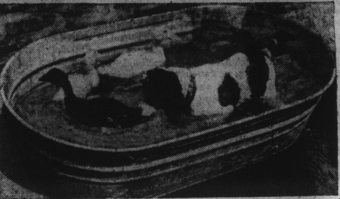
DUCK SOUP'S FOR PUPS—Puppy at the Animal Welfare Society shelter in Chicago plays ring-around-the-washtub with grounded ducks.