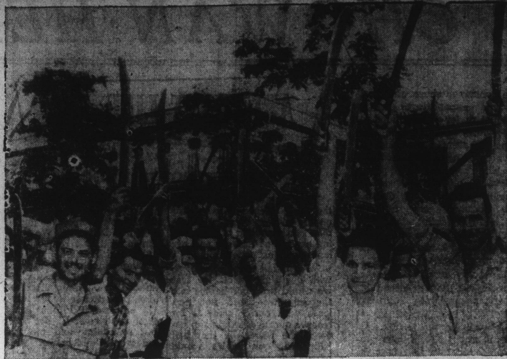
NEXT TIME, WITH FEELING — Brandishing their machetes, a group of farmers from Cuba's Oriente Province seem to lack the proper accompanying facial expressions. They marched on Havana for the anniversary of the first rebel attack on the former government.