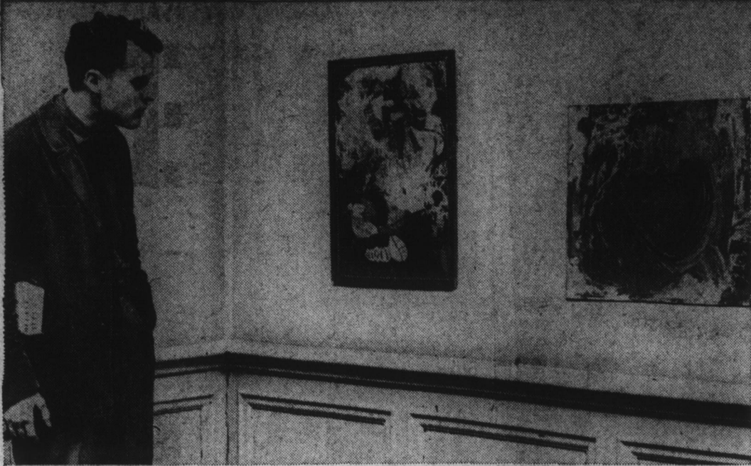
HOW PRIMITIVE CAN YOU GET?—Swedish artist Oyvind Fahlstrom glares at two of his paintings hanging in an exhibition in Stockholm. Reason for his irritation: painting on the right is actually his brush board which he used as a protective backing for his works. Exhibition officials mistakenly hung the board with his other creations.

As The Herald goes to press, I haven't heard if the Edenton Band will go to Scotland Neck Friday night. Here's hoping it does, for they are needed to make the football game complete. They're improving all the time and my hat's off to 'em.