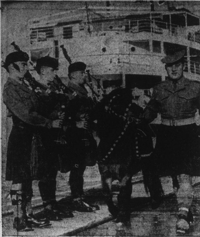
PIPED ASHORE —As bagpipes blare, the pony mascot of the Scottish Battalion is led ashore in Southampton, England. The troops arrived home from a tour of duty in Cyprus.