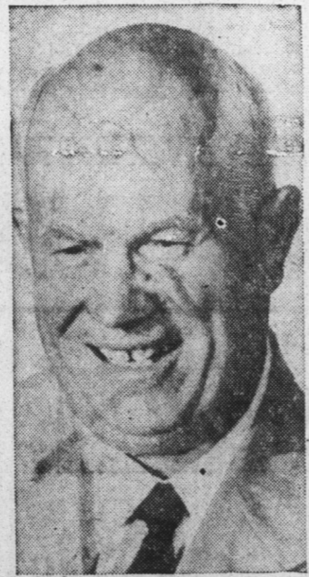
BEAMING —Addressing a National Press Club luncheon in Washington, Soviet Premier Nikita Khrushchev wears his most common expression, a wide smile.

used as quickly as possible after death have made a large number of cornea transplants possible. Giisson cited the cooperation of the highway patrol and airlines in transplanting corneas to the point needed quickly.