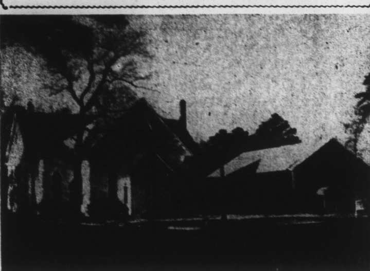
The congregation of the Rocky Hock Baptist Church, pictured above, will celebrate the 125th anniversary of the founding of the church on Sunday, July 31. The celebration will be featured by homecoming festivities beginning at 10:30 A. M. and continuing until about 3:30 o'clock in the afternoon.