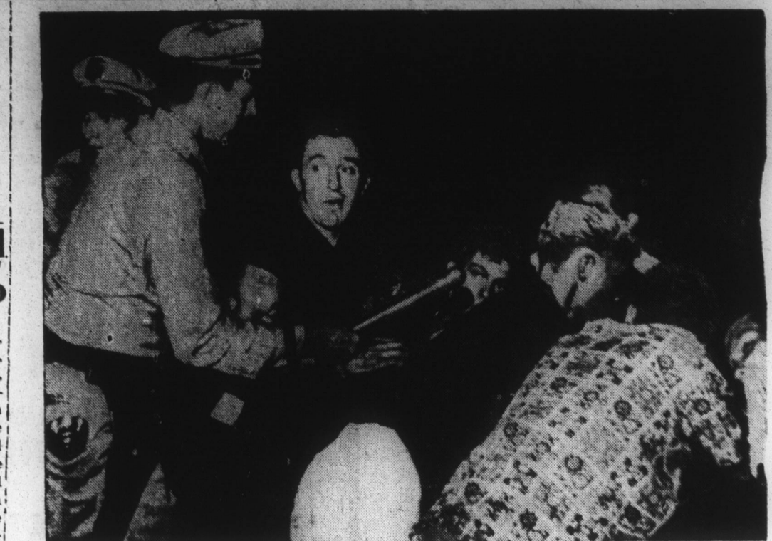
DRAGGING FOR TROUBLE—Club-swinging police waded into a crowd of youths as a riot breaks out in San Diego, Calif. Some 80 adults and 36 juveniles were arrested after an attempted drag race.

Peoples Bank & Trust Company and the Commercial Bank will be closed all day Monday, September 5, in observance of Labor Day, a national holiday.