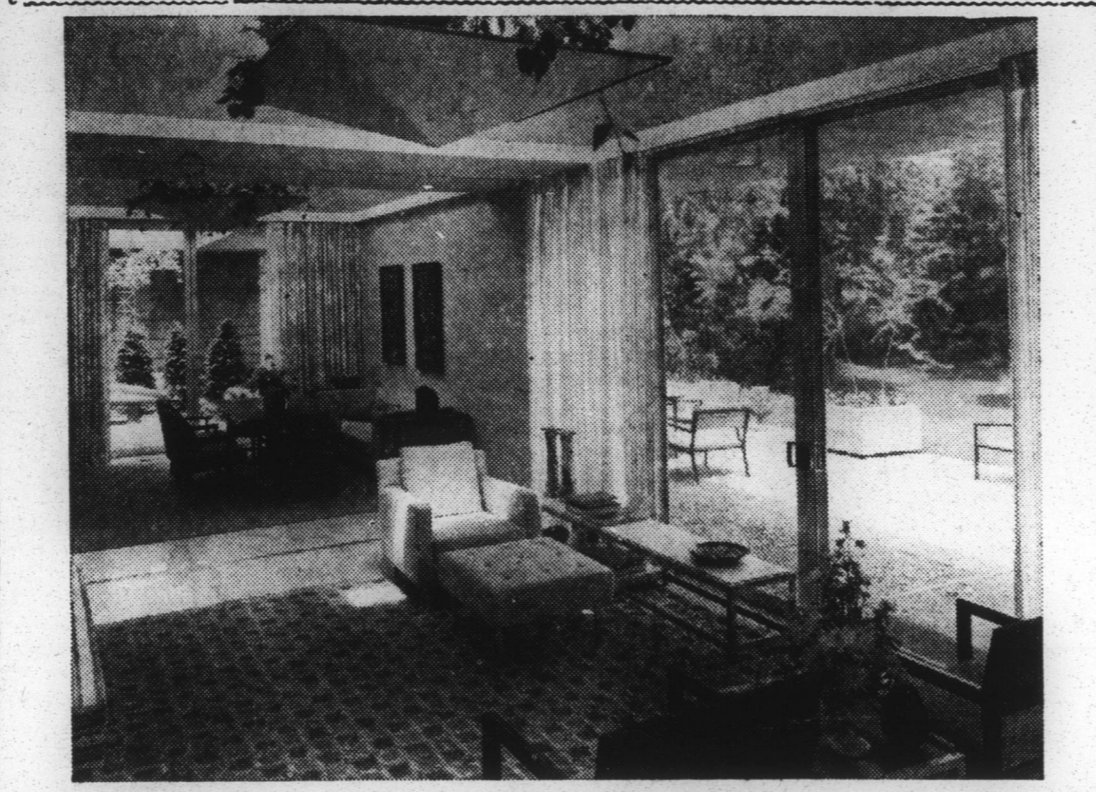
"The American Idea," a fabulous new home furnishings color slide program featuring the Celanese House, will be shown at the meeting of the Edenton Woman's Club at its meeting in the Edenton Restaurant Wednesday afternoon, October 5, at 1 o'clock. This view from the end of the living room through the dining room opening on to the north terrace is one of the interesting sections of the house. Here is seen two of the 12 skylights and hanging gardens, through which light filters into the rooms. This is one of the 48 room settings in "The American Idea" home furnishings program presented by Celanese Corporation of America.