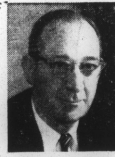
EVERETT JORDAN for U. S. SENATOR