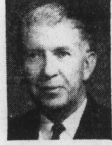
CHARLES CARROLL for SUPT. OF PUBLIC INST.