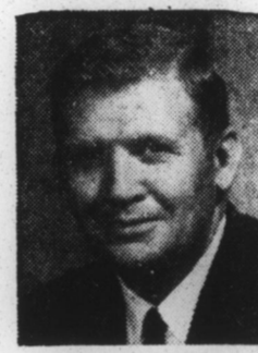
TERRY SANFORD for GOVERNOR