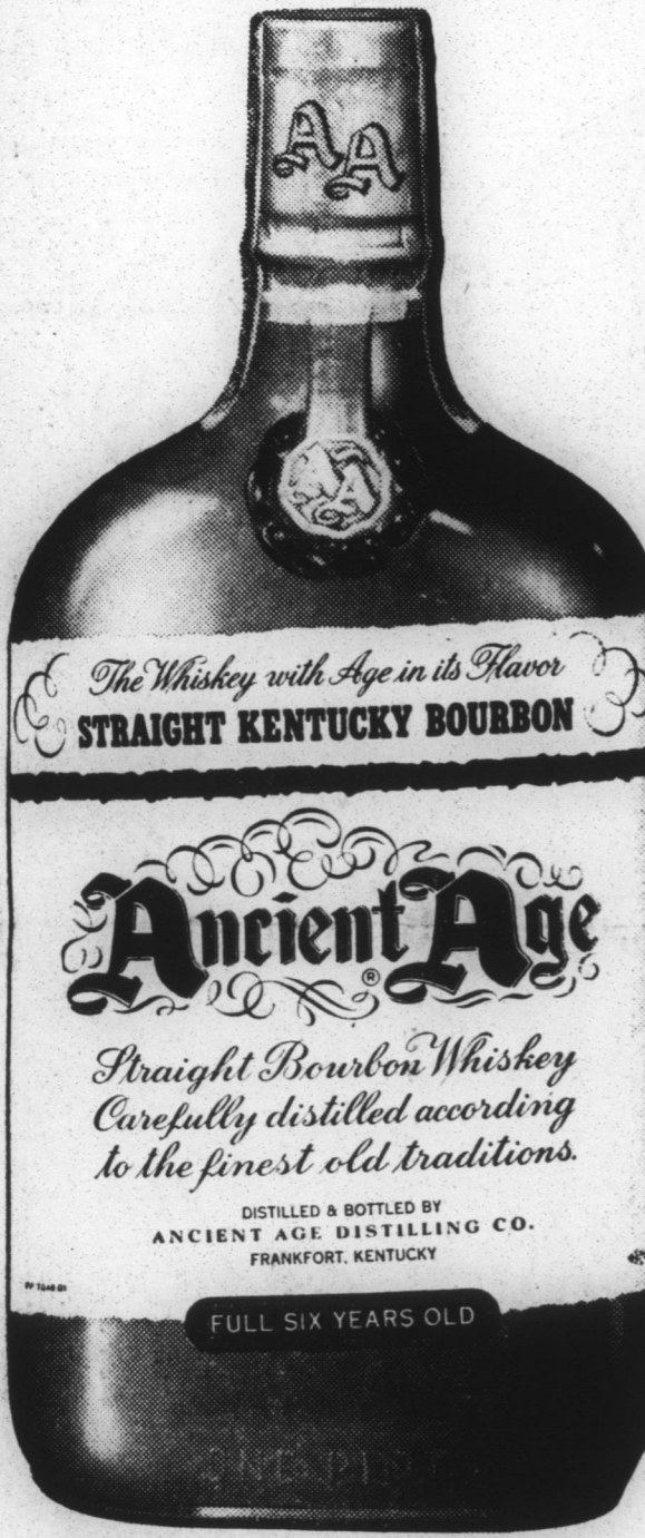
STRAIGHT KENTUCKY BOURBON WHISKEY, 86 PROOF ANCIENT AGE DISTILLING CO., FRANKFORT, KY.