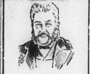
CHARLES H. SPURGEON

"None of us can escape responsibility. Each man's life is each day an influence for good or evil."