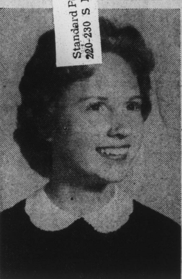
Standard Printing Co. 200-230 S. First St.