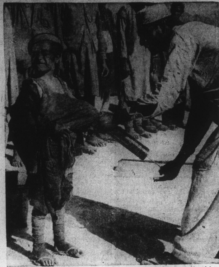
TAKING A POWDER —Although his face is comical, this young nomad boy willingly submits to the discomforts of being dusted with DDT and talcum powder at a "de-lousing" station on a highway near Malagan, Pakistan. The United Nations Children's Fund is helping with typhus control. Typhus has long been one of the nomads' major enemies.

provides in essence that "conclusion of the President on any part of the bill, shall be conclusive". I think that will arouse some opposition. There is some feeling that it is an effort to "nail the courthouse door shut with reference to interpretation of the tariff act."