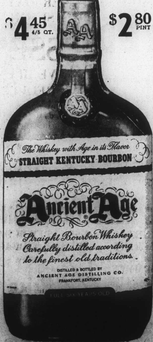
STRAIGHT KENTUCKY BOURBON WHISKEY, 86 PROOF ANCIENT AGE DISTILLING CO., FRANKFORT, KY.