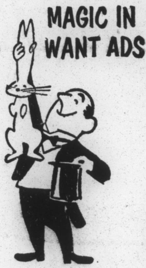
— IN — THE CHOWAN HERALD

Like any other bearings, your bursae stay trouble-free much longer if you warm them up slowly and let them get fully lubricated before you race your motor.