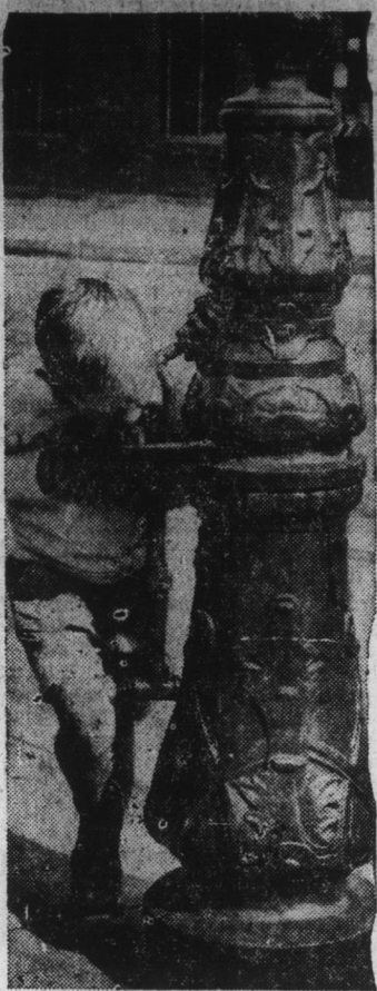
MOUNTAIN DEW —Ray Sidle, 7, couldn't resist trying the fresh mountain water which runs continuously from an ornate water fountain at a crossroads in Millheim, Pa.

are useless. The most common preventives for hay fever are:—Get specific anti-hay fever shots well ahead of the season. —Keep away from areas where ragweed pollen loads the air. —Air conditioning, both at home and in the office, combined with good air filters, will often help. —Antihistamine drugs lessen congestion and relieve itching. —Keep your home immaculately clean and free of dust.