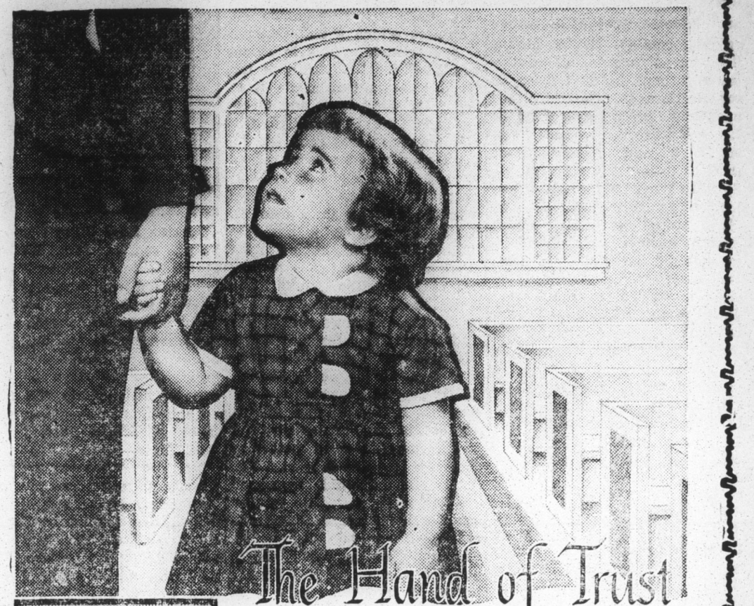
The Hand of Trust

Almost every frightening step of childhood is marked by a singular emblem of trust. A child's trembling fingers grope upward. A parent's warm grasp is felt. And youth steps forward into new paths, fear melting into confidence. God must count on parental hands to lead His little ones to Him. For religious training is part of the vast unknown until Mother and Dad begin to lead their child each week to Church. Yes! God counts heavily on our hands. There is no one else into whose palm our child's fingers slip so readily. No others can teach the early lessons of faith and prayer so simply, nor illustrate them so vividly at home. Indeed, that loving hand of trust which leads a child to Church seems in turn to be clasped by the hand of God.