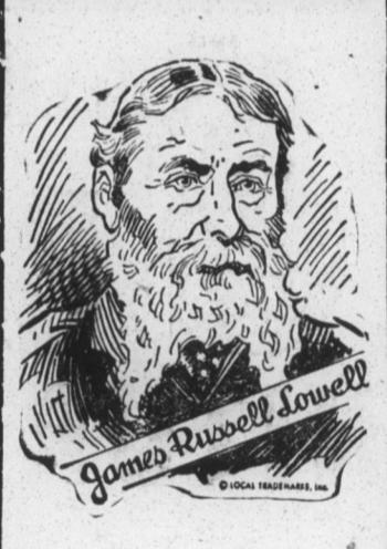
James Russell Lowell