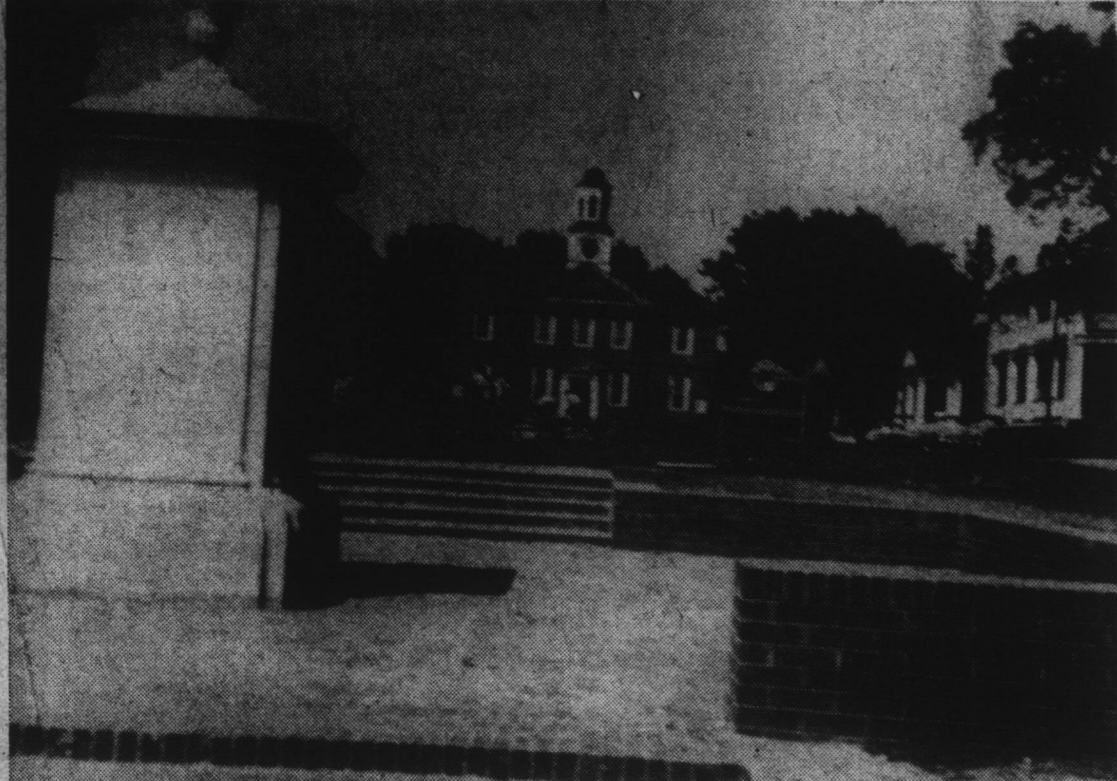
Pictured above is a view of the Joseph Hewes monument on the Court House Green, around which a plaza has just been completed by the Edenton Woman's Club. In front of the monument a neat brick sidewalk has been constructed and brick steps are on the green, as well as at the entrance to the Green in front of the Court House on King Street.