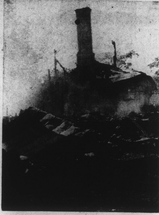
The above picture shows the home of Mrs. Inglis Fletcher, Bandon Plantation, following the disastrous fire Sunday afternoon. The fire completely destroyed the main dwelling house, but firemen were able to save the old kitchen and the old school house.