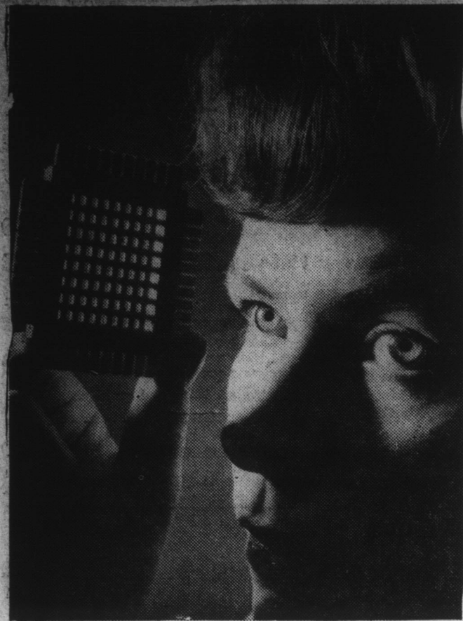
GIRL WITH BRAIN —Electronic brain of the future will look like this—the item at the left, that is. It is a part of a computer being built in St. Petersburg, Fla.