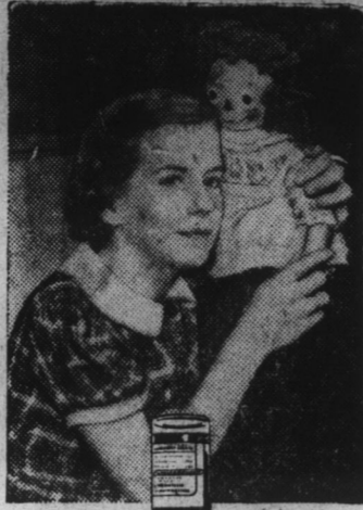
Someone, somewhere will LIVE ...to thank you!