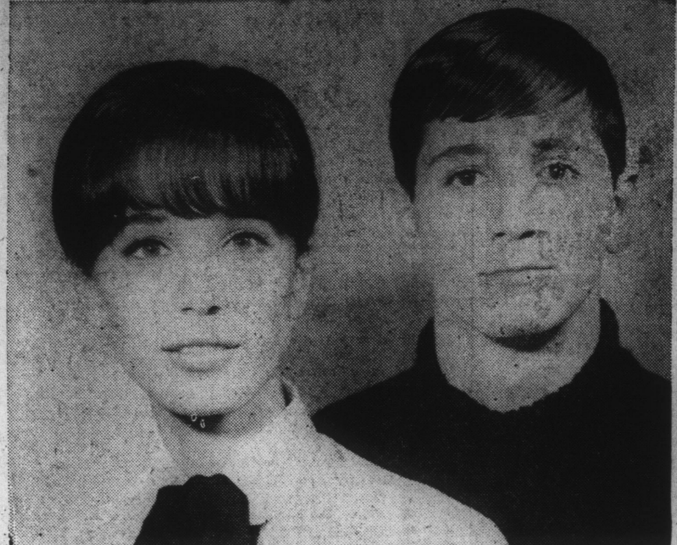
MODIFIED BEATLES —Togetherness marks the theme of these New York his and hers Beatle haircuts. The hairstylist who created them calls them Beatle Bobs.

And speaking about fishing, a news release was in the mail this week about a new patented and tested electronic transistorized fish call.