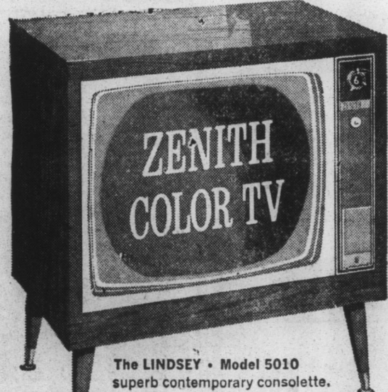
The LINDSEY • Model 5010 superb contemporary consolette.

handwired, hand soldered—no printed circuits