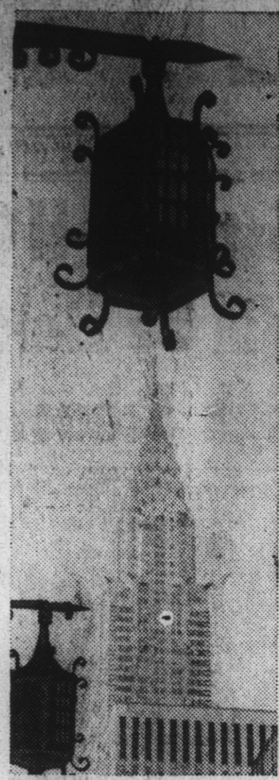
LIGHT POINT —Looks like the needle-point New York skyscraper is topped by an ornate lamp on the front of a church between First and Second Avenues, but it's only a camera illusion.