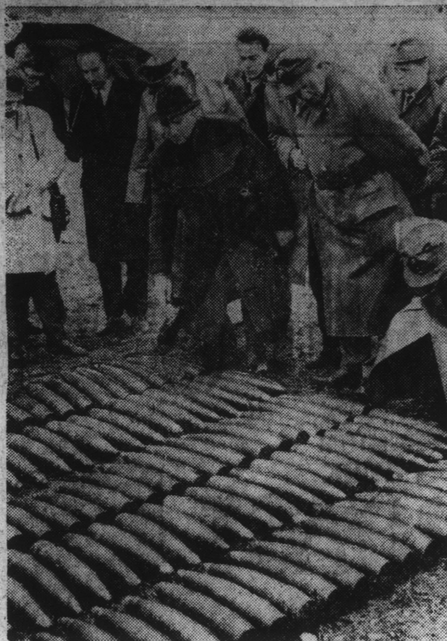
LEFTOVERS —Officials view some of the 32,000 mustard gas shells that threatened Vienna's water supply. The shells, buried by the Nazis during World War II near Austria's capital, are to be destroyed.

There were two general assistance cases costing $23.90. Eight cases were hospitalized in the county, costing $1,560, of which the county's part was $420. Four cases were hospitalized outside the county, costing $234, of which the county's part was $54.