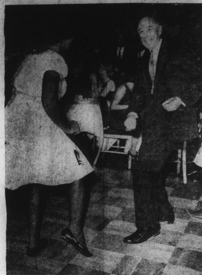
NO MORE TWIST —When Arthur Murray takes a dancing lesson, something must be new. Murray is learning the Jamaica Ska, new dance sensation.