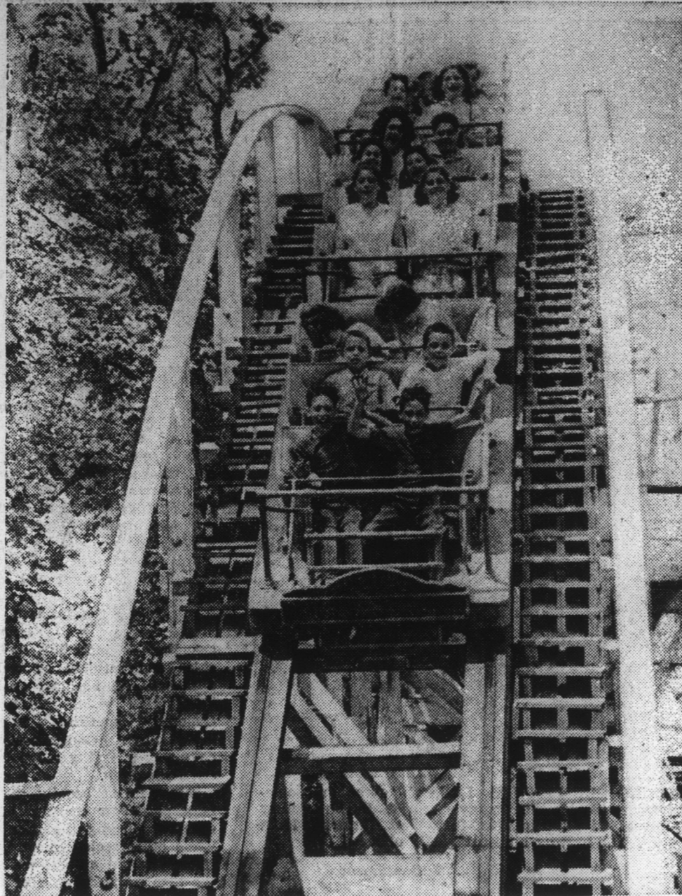
DOUBLE FUN —Mingled with the roar of a roller coaster ride were the screams of twins getting double enjoyment on a day's outing in Coney Island, N.Y. The ride was part of the festivities at the amusement park's annual "Twin Day."