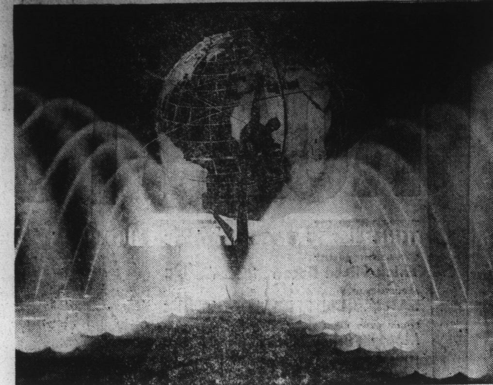
A THING OF BEAUTY—The New York World's Fair is a photographer's paradise. And this illuminated fountain near the Unisphere is a favorite scene. Thirty 1,000-watt mercury floodlights create the breathtaking display.

and American Farm Bureau Federation is such an organization."