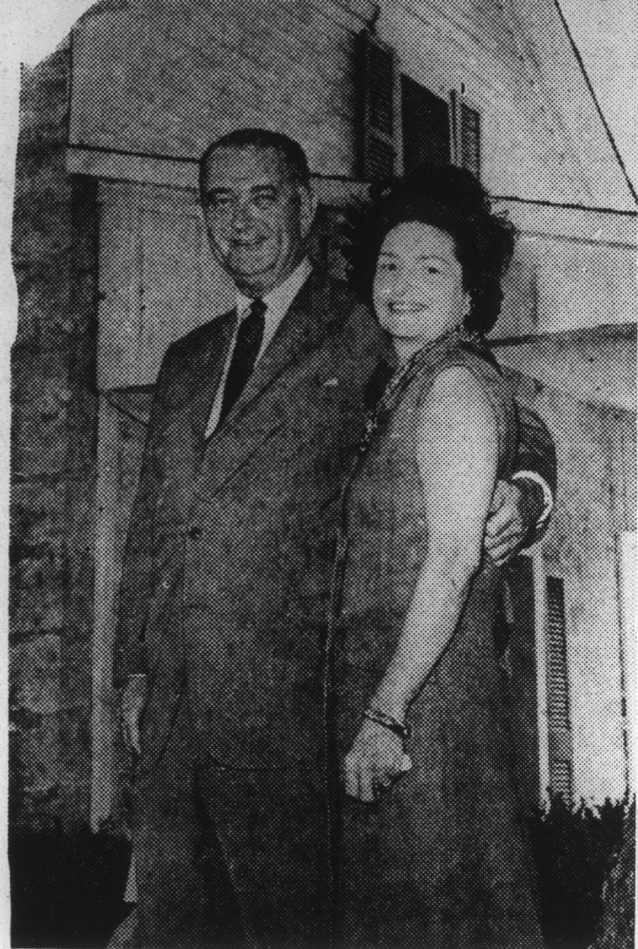
LBJ AND BJB—President and Mrs. Johnson occasionally escape the Washington bustle by resting at their ranch near Johnson City, Tex. In background is their home.