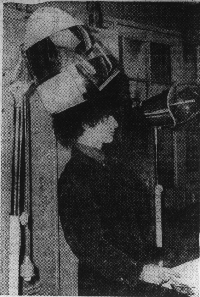
BASIC FOR BEATLES —Ever wonder why a Beatle looks the way he does? A hair dryer is the secret. Beatle Ringo Starr uses this custom model faithfully. And why not?

Nature is but a name for an effect whose cause is God. —William Cowper.