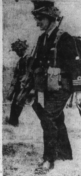
TOP HAT —Are two hats better than one? This British Naval officer had no place to stow his cap. So he just perched it on his steel helmet.

The increase in the savings rate may be only temporary. That is to say it may give us protection from inflation only for an interim period. But even what has happened so far has an important bearing on economic