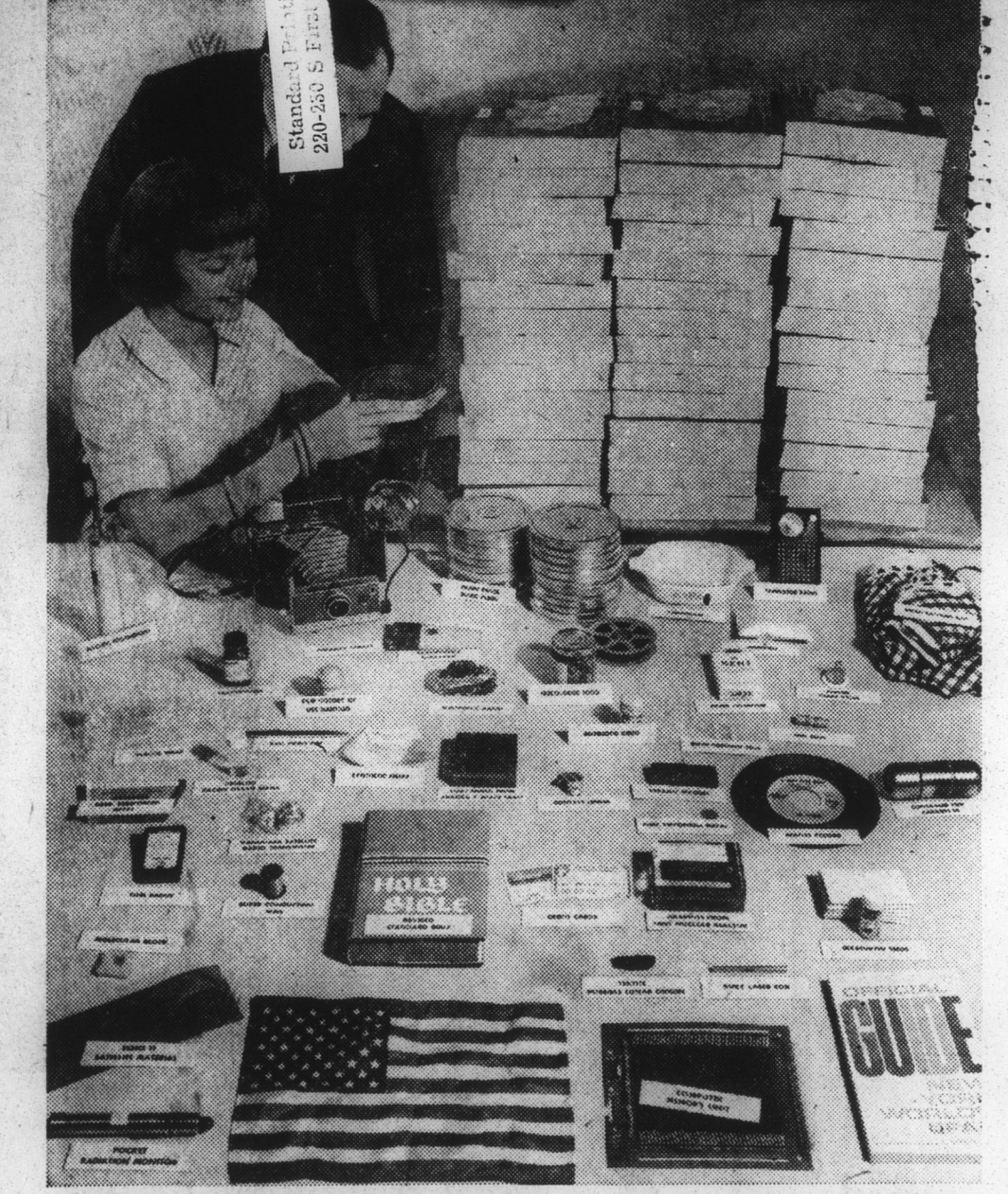
FOR THE YEAR 6939-Westinghouse employes check the contents of a time capsule which will be buried at the end of the New York World's Fair. The capsule won't be opened for 5,000 years. It contains everything from Beatle records to Bible.

20 Years Ago ses, Chantes, Dic-kees, Rhythm Steppers, and acts from Edenton, County and Hertford.