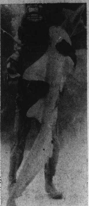
DEEP STORY—Divers at a Miami aquarium are used to unusual tasks. This one had to flop a 200-pound nurse shark over his shoulder and carry it out of the deepwater tank.

THE BALTIMORE NEWS AMERICAN On Sale At Your Local Newsdealer