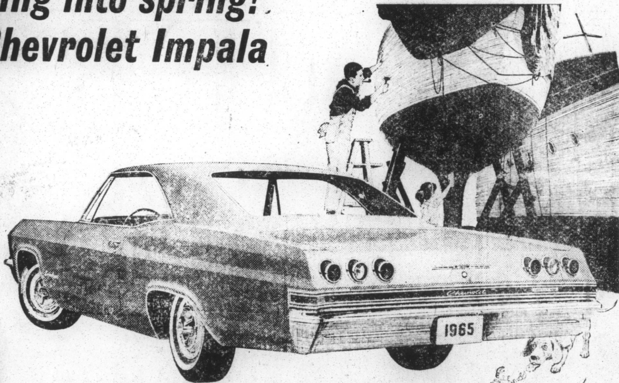
Chevrolet Impala Super Sport Coupe—one of two bucket-seated beauties for '65.

People who buy other big expensive-looking cars get one thing you won't (big expensive-looking payments)