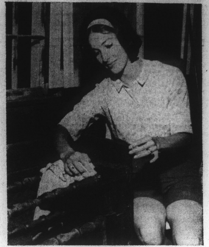
... Then Starts Antiquing

Earlier this year she attended a travel show in