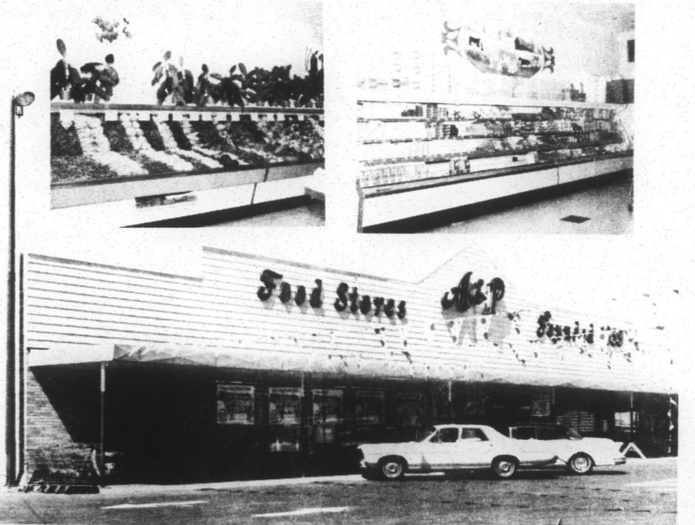
THE "NEW" A & P—A five-week grand reopening event opened this week at A & P Super Market on North Broad Street. Pictured above is the new front of the building, showing the recently resurfaced parking lot. The insert at left shows the expanded produce department. In the right insert is a portion of the dairy foods department.