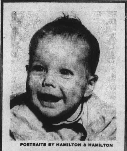
PORTRAITS BY HAMILTON & HAMILTON

2 DAYS ONLY FRIDAY & SATURDAY NOVEMBER 24th - 25th Get A Huge 11x14 or 8x10 $1.00 Portrait OF YOUR CHILD Hours: 10 A. M. 'til 5 P. M. (LUNCH 1-2)